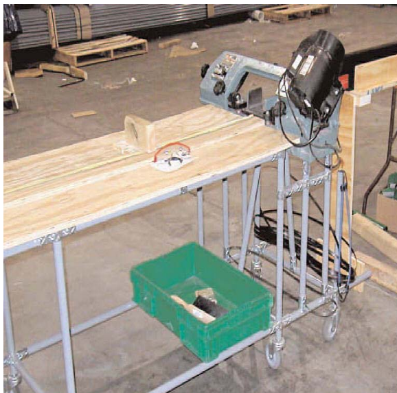
Saw and Cutting Table (Kit Only)