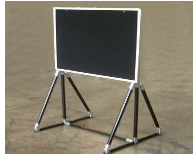
2.5' x 2.5' Velcro Operator Board