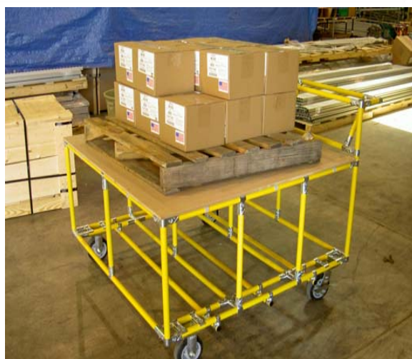
Pallet Transport Cart