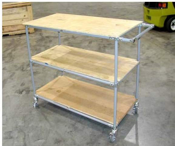
3 Level Push Cart