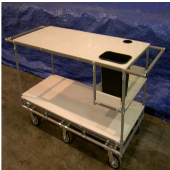
Inventory Pick Cart