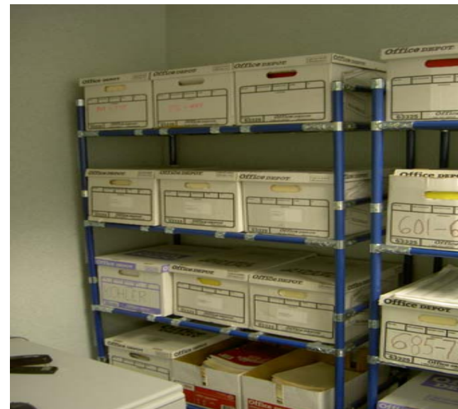
4-Level File Storage Rack