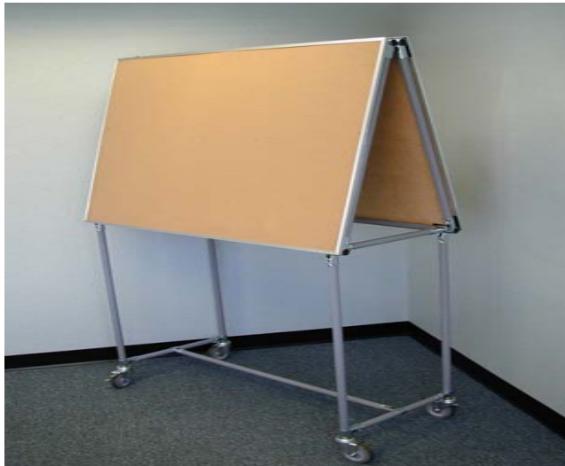
4' x 6' Double Sided Cork Board

Multiple colors available, ask your sales rep for details